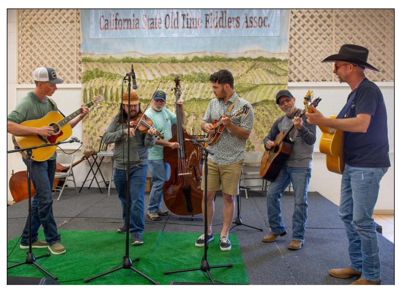
Fiddlers competing at 2024 California State Old Time Fiddle and Picking Championships.