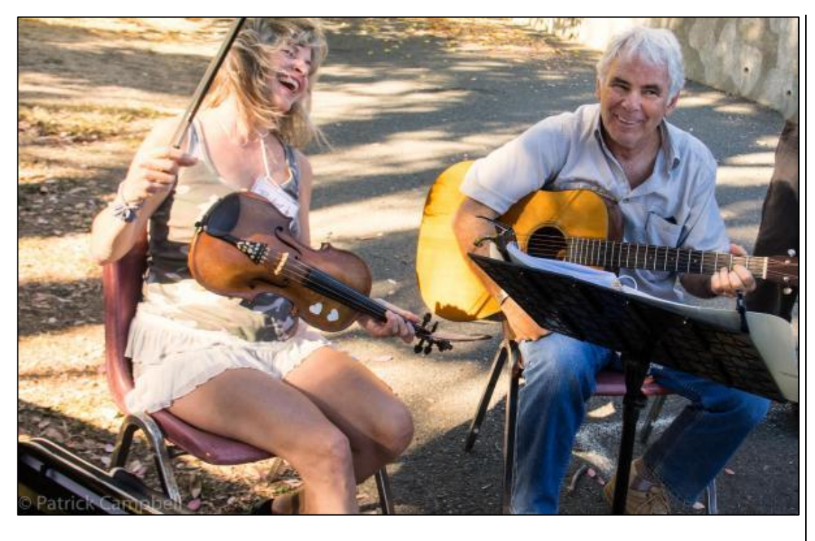
Jamming at Walker Creek Music Camp