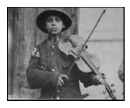
Historic image