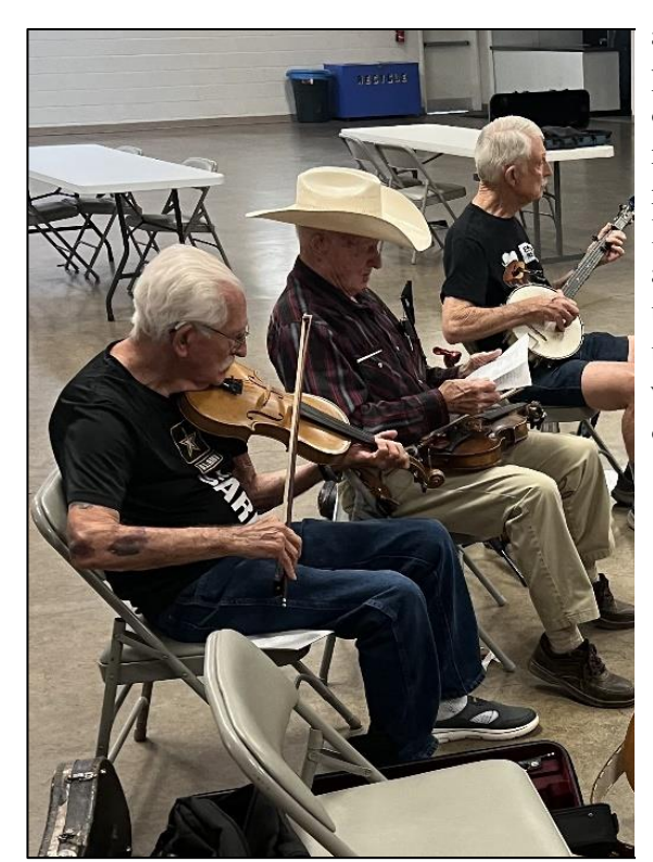
A well-attended District 5 jam

District 5 has held its annual election for 2025 officers with the following results: