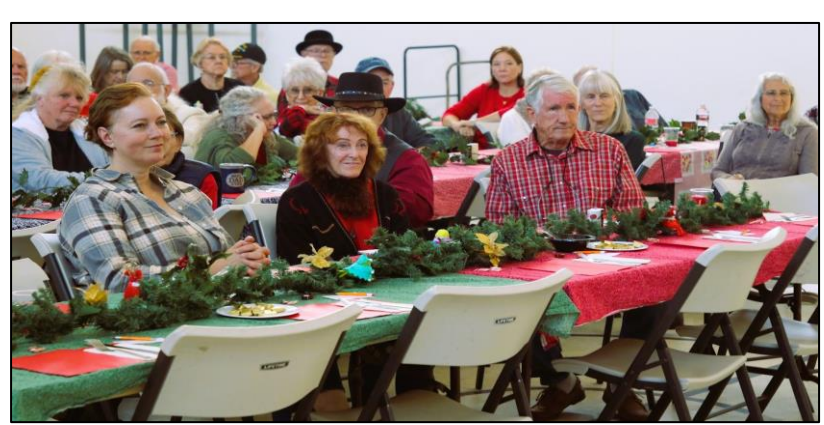
District 8 holiday dinner attracted60 members.