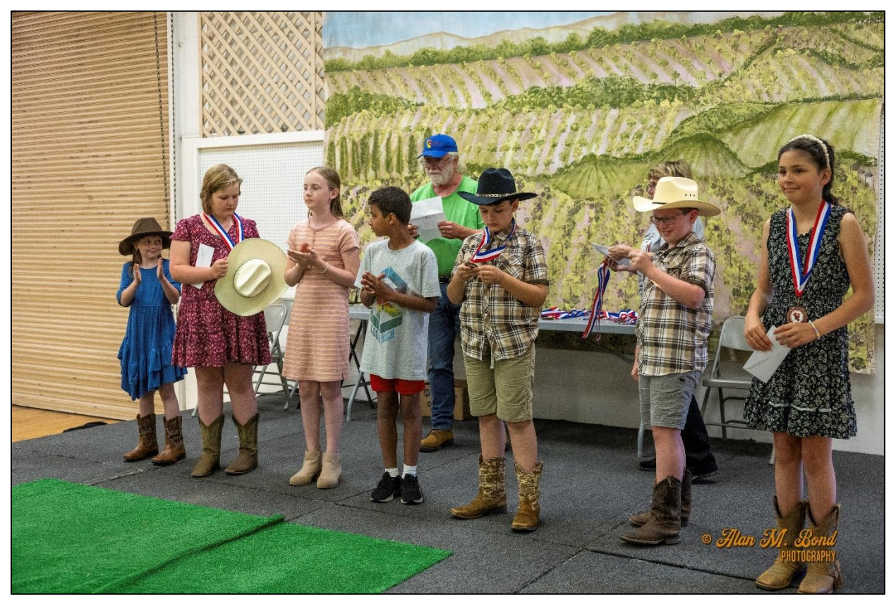
2024 Junior-Junior Contest Winners