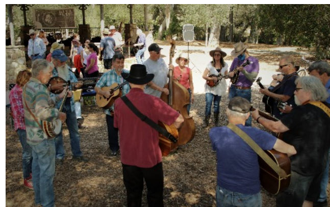
The Jam after the concert at Libby Park, Ojai on May 23 rd , 2021